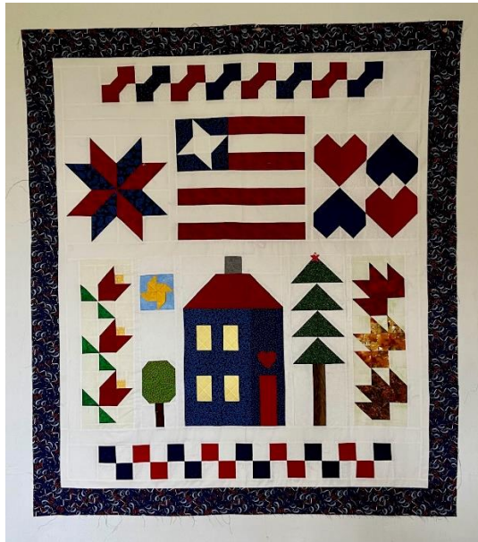
10" (finished) Sawtooth Star Block