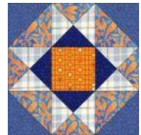
Swamp Angel (You can make up your own story how this name came about!)