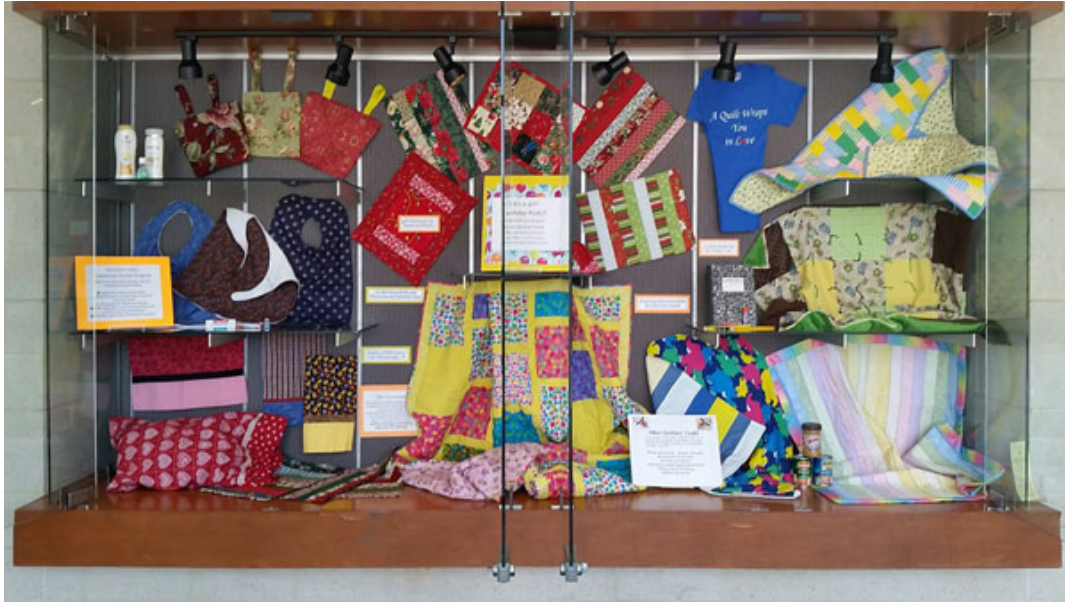
Celebrating the Guild's Community Service and our 30 th Anniversary