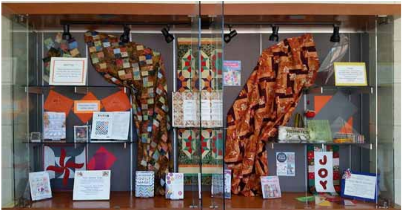
Allen Library Display (Thanks Lorraine!)